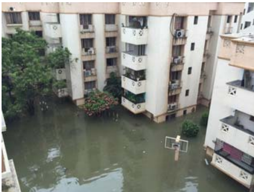
Residential flats without supply of essential provisions and power, and with ground floor submerged in water, during Chennai floods.