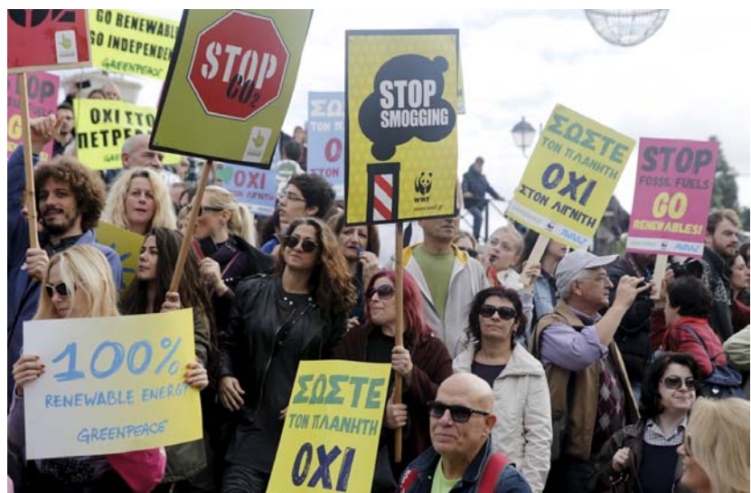
Protesters outside the Paris Climate Conference Venue.

Baseless arguments have been made by developed countries that developing countries including India and China will be the worst sufferer from climate change impacts. In a recent example of pressurizing India to accept developed countries' analysis that India may be hotter by 8°C and loose $200 billion per year (Hindustan Times, July 16, 2015), forgetting the devastation caused by European heat waves that killed 70,000 Europeans in 2003. In the Ten global ranking of heat wave mortality, European heat wave