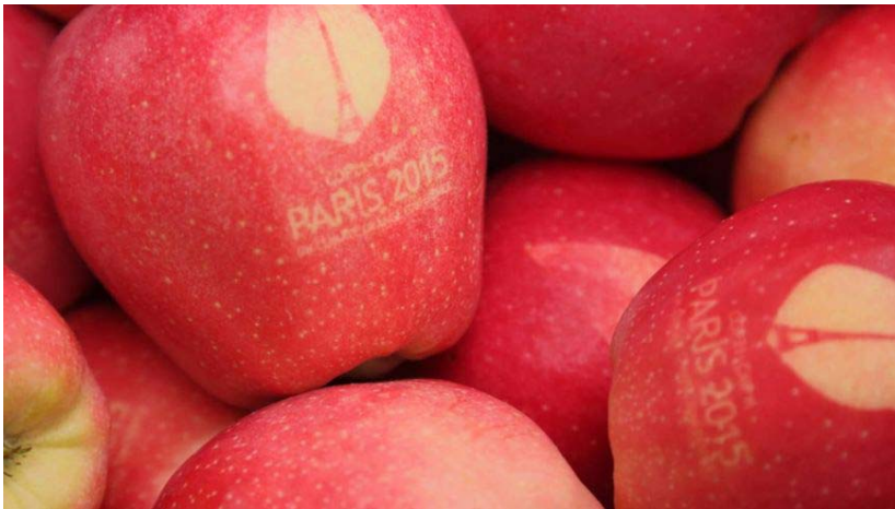
Paris Climate Conference.

mortality was the at the top, followed by Russian heat wave, and US heat wave mortally figured at 3 rd , 4 th , 7 th , 8 th and 9 th positions. India's heat wave mortality in 2003 was placed at number 6 th ranking. In one of my papers I argued that not only India and China but even developed countries—USA, U.K. and other nations of Europe are vulnerable to climate change. Katrina (2005) and Sandy (2012) hurricanes had devastated USA, and flooding in Europe and forest fires in Australia and recently in California are examples that show that even western countries are more vulnerable.