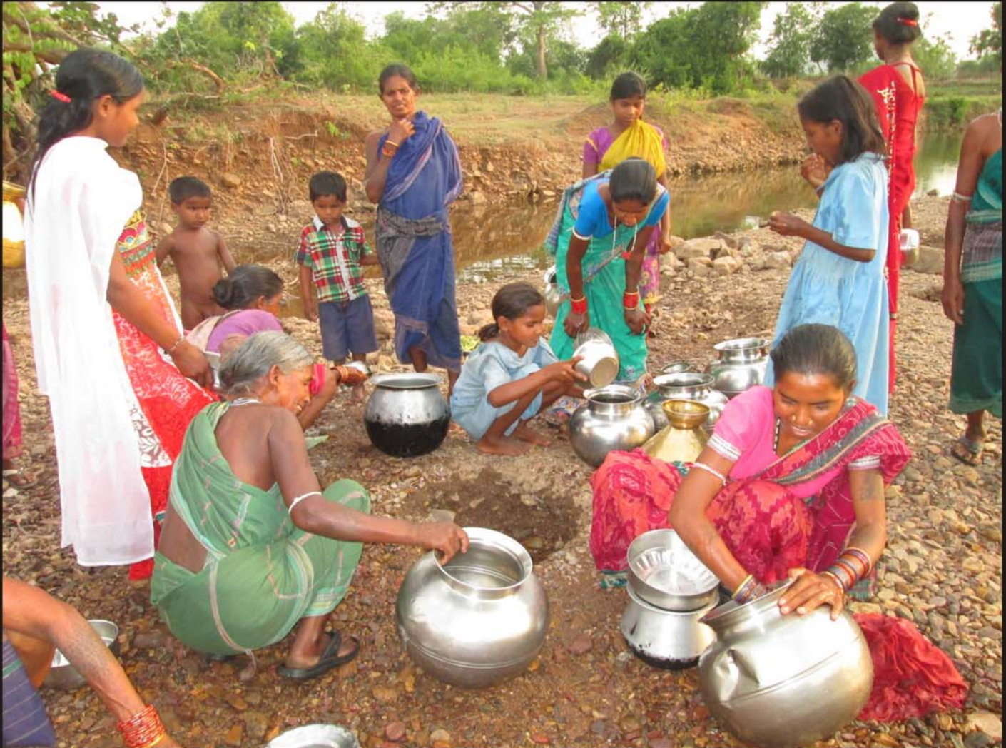
A water scarcity in Nuapada district of Odisha.