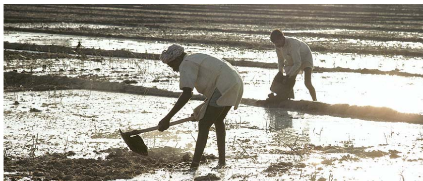
Indian farmers: courtesy World Bank.