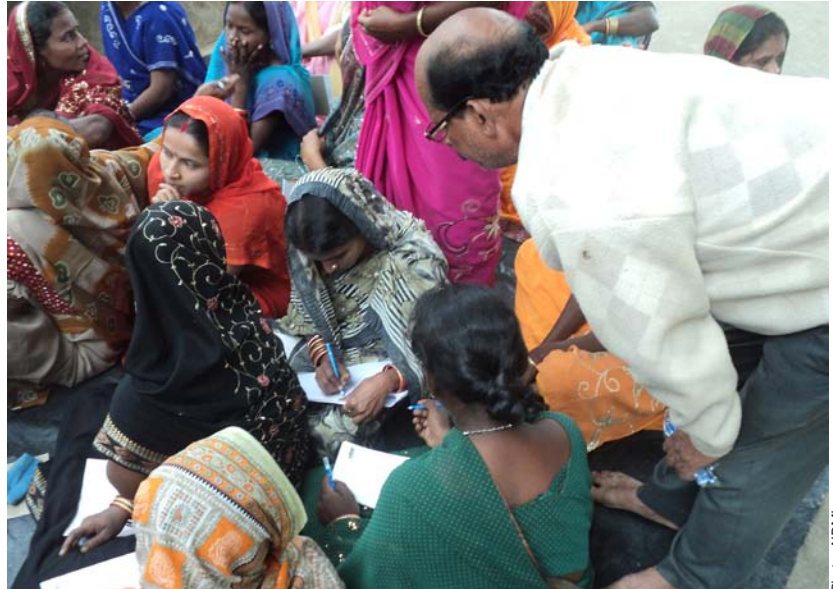
District level stakeholders' consultations on making district disaster management plan pro-poor of Puri, Odisha.

in India offers a way ahead to find support for making such a state level Road Map.