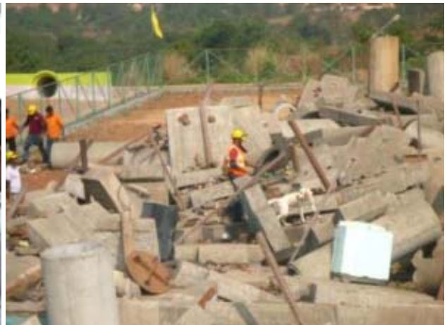
Training of NDRF personnel towards INSARAG External Classification.