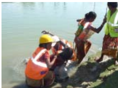
A woman rescued by Search and Rescue team in West Bengal.

For example, ECHO partners have been working in the Sunderbans delta in West Bengal, which is frequently hit by floods and cyclones, putting in place village teams responsible for early warning systems, search and rescue operations, first aid, and child and women protection during a natural disaster. Each team has received specialized training and necessary equipment such as stretchers and first aid kits. Mock drills are also being organised to raise awareness amongst the villages.