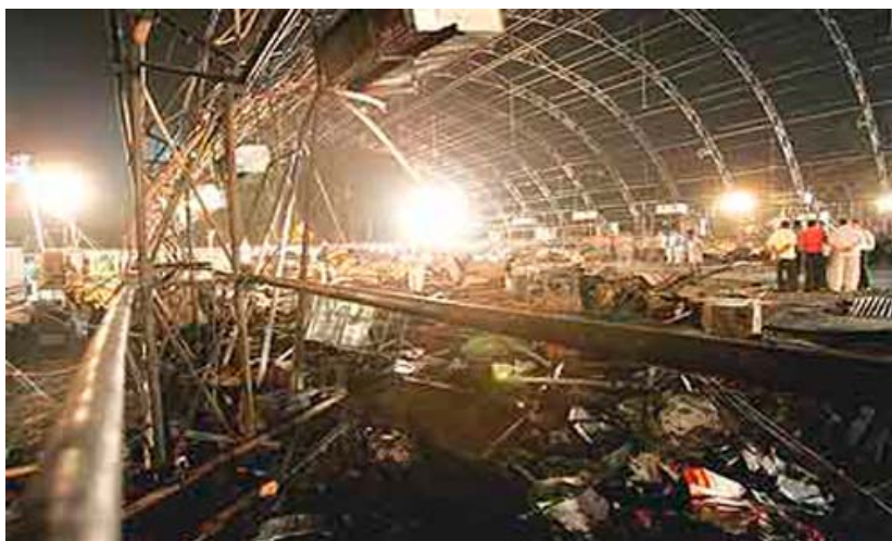
The aftermath of the fire accident at a school in Dabwali, Haryana.