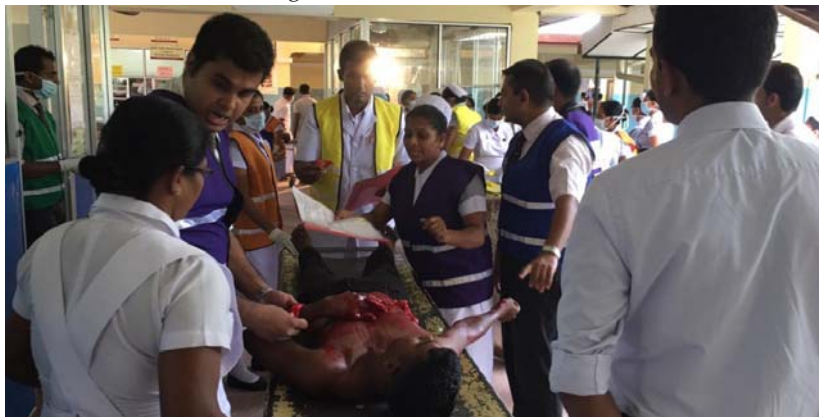
Disaster preparedness and drill at Base hospital Kantale, Sri Lanka.

In addition to having a well documented HDMP in place, it is prudent to have regular drills to test the hospital's DMP. The drills may be hospital disaster drills, computer simulations and tabletop or other exercises. Hospital disaster drills should test various components viz incident command, communications, triage, patient flow, drugs and consumables stock, reporting, security and other issues. The key