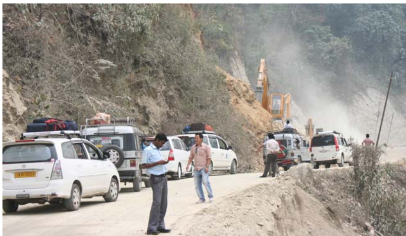
View of highway between Gangtok, Bagdogara.