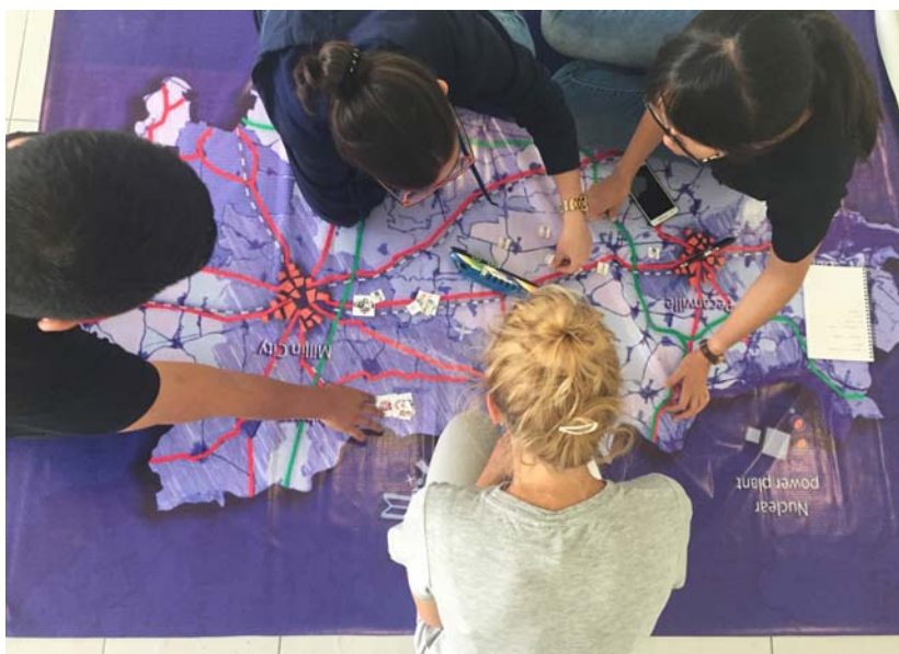
Disaster Medicine Training.

In post Sendai Framework adoption phase, it is now preparing to ensure meaningful participation of children