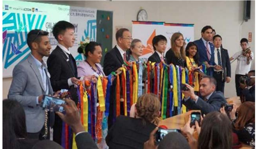
Keep in hand with hot air full of International Youth Forum, March 15, 2015, Sendai.

They recognize the importance of DRR, and have not waited for global political consensus to start working on all aspects of DRR. A few recent