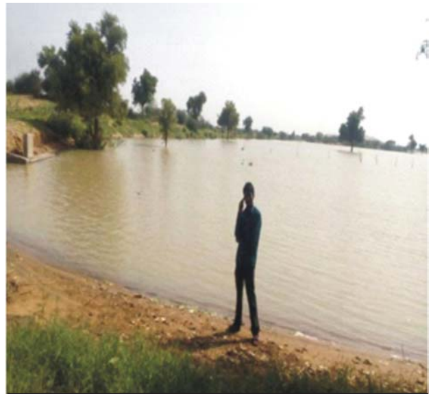
Jalela Community Khadin (Before & after rain pictures, harvested around 43000 Cum rain water).

the community's resilience to drought and reduced socio economic vulnerability