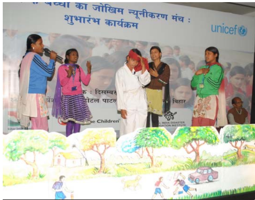
Play by Girls of Darbhanga on Girl Child Participation in Disaster Risk Reduction.

Various agencies (Action Aid, Asian Disaster Preparedness Center, Plan International, Save the Children and World Vision) have played important roles in developing and pioneering child-centred DRR approaches. According to Plan International, child-centred DRR combines child-focused DRR (for children) and child-led DRR (by children). It acknowledges that adults have a responsibility to implement child-focused DRR to support child-centred DRR. "Child-centred DRR is an innovative approach to DRR that fosters the agency of children and youth, in groups and as individuals, to work towards making their lives safer and their communities more resilient to disasters. It is empowering for children, and respectful of their views and rights as well as their vulnerabilities" (Plan International, 2010). "Child-centred DRR means putting children at the heart of the DRR activities – recognising the specific vulnerabilities children face from disasters, which differ to those faced by adults, and ensuring children are appropriately planned for and addressed