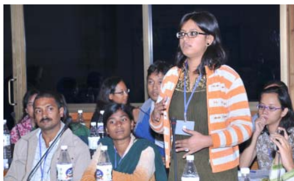
Role of youths in disaster risk reduction must be defined.