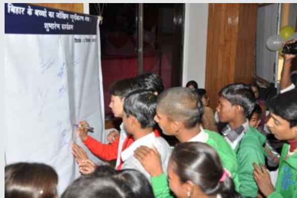
Children of Bihar are signing Children's Charter.

Do you wish to receive this publication regularly? Write to AIDMI ( bestteam@aidmi.org ). The publication will be sent by E-mail. Your comments help southasiadisasters.net remain an effective and informative resource for regional issues of disaster risk management. Please contribute comments, features, reports, discussion points, and essays about your work. Today!