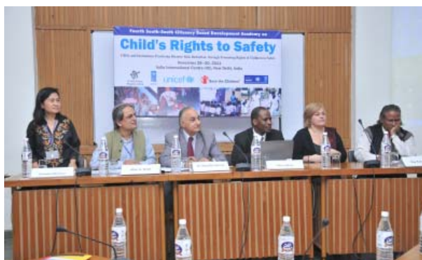
Policy makers and practitioners are planning on how to make children safer.

Local Development Academies ('LDAs', formerly known as Citizenry-based Development Academies) can be a useful forum for facilitating solution exchanges, learning, networking, knowledge-sharing, collaborative work relationships and cross-cultural dialogue. Established in 2010 by the United Nations Special Unit for South-South Cooperation (UNSUSC) in partnership with local and national organisations, LDAs draw together community members, field practitioners and community-based organisations from across the Asia-Pacific region to share and discuss their successes, challenges and lessons learned on specific disaster management issues, such as the recovery from the 2001 earthquake in Bhuj, India, and citizenry-based development-oriented disaster risk reduction and climate change adaptation initiatives. Their highly interactive, discussion-oriented and case study-based approach makes LDAs an ideal place to showcase best