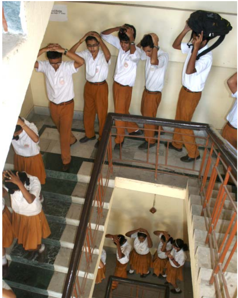
Children in Assam are practicing a mock-drill on Earthquake.

The GEMEx experience shows that EMExes are an ideal forum for building the capacities of schools, staff and students in a highly interactive, participatory, multi-stakeholder, and community-based environment. One important feature