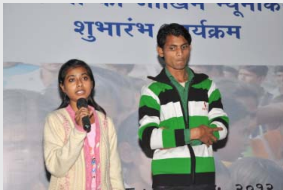
Children are discussing way ahead of state platform for children participation in DRR.