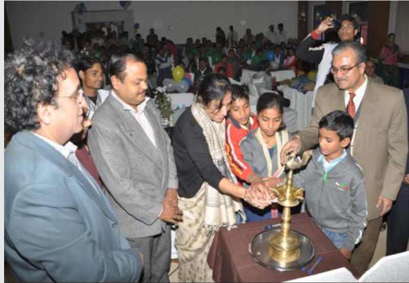
Launch of state platform for children participation in disaster risk reduction on December 5, 2012 in Bihar.

The All India Disaster Mitigation Institute (AIDMI), a long-standing proponent of child rights and child-centred disaster risk reduction, has continuously carried out a wide range of advocacy activities. At the end of 2011, together with UNICEF, Plan International, SEEDS and Save the Children, AIDMI launched the Children's Charter for Disaster Risk Reduction at the National Platform on Children and Disaster Risk Reduction in New Delhi, India. This had been developed following consultations with school students.