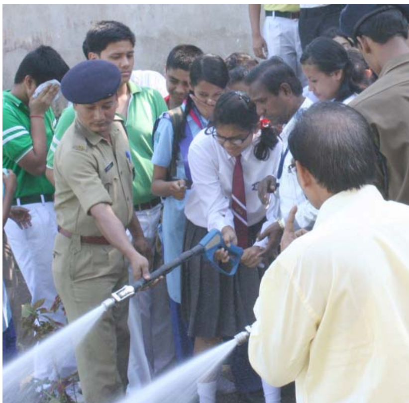
Children are learning to operate fire extinguishers in Assam.

So far, EMExes have been held in India's most disaster-prone cities - Mumbai (2008, 2010), Chennai (2011), Delhi (2012), and most recently, Guwahati. Their activities consist of training courses covering a range of emergency management skills, such as advanced life support, triage, and emergency hospital management, a table-top exercise where all the participants had to develop responses to simulated scenarios, and a mass mock field-drill. The Guwahati Emergency Management Exercise (GEMEx), held from 29 October 2012 to 4 November 2012 was unique as for the first time, upon the instigation of UNICEF and AIDMI, more than 60