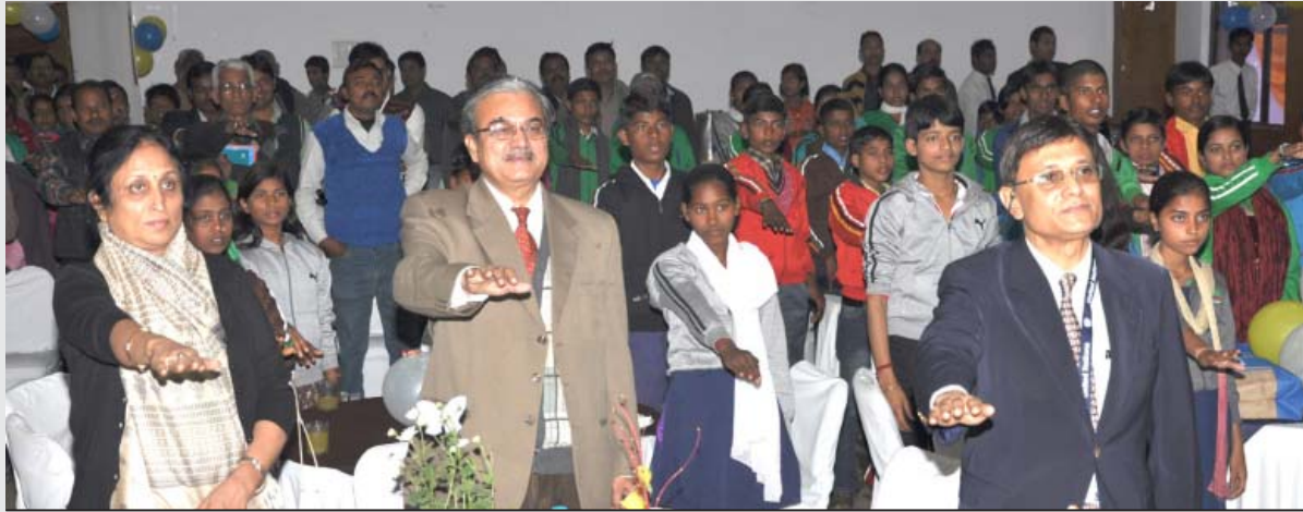
Policy makers in Bihar are taking pledge to ensure Children Safety and their Rights to Safety.