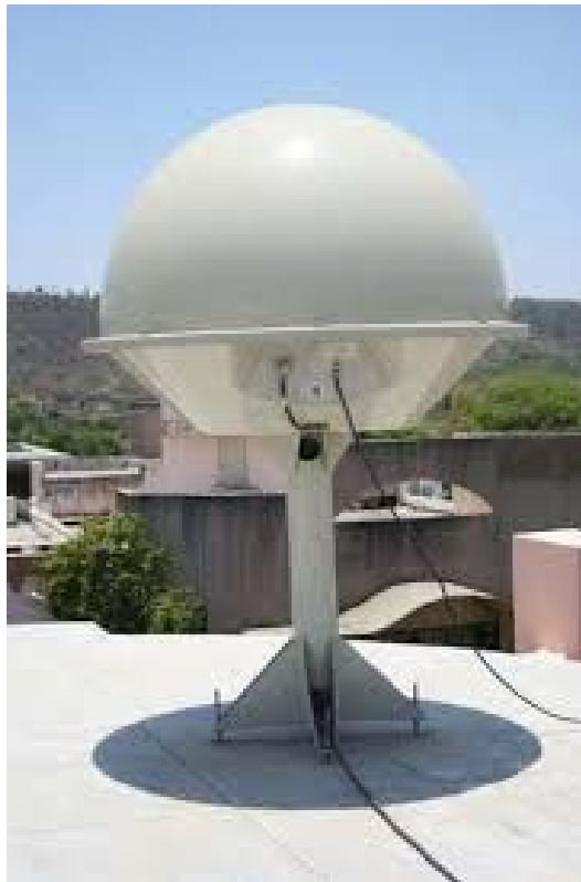
EWS at Odisha meteorological station.

Forecasting for floods, flash floods, fire, stampede, earthquakes and any other geospatial disaster involves different compartments which are interconnected yet separate in operations, equipment and rescue designs. When the