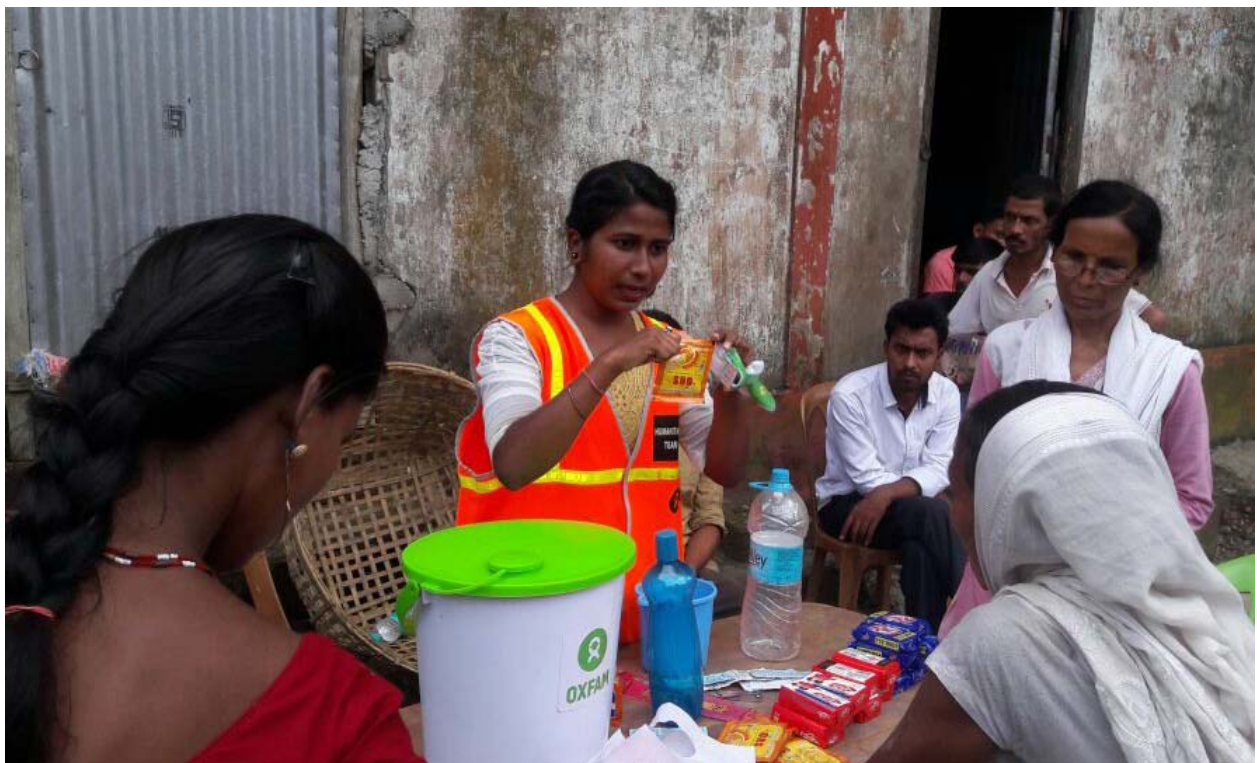
Oxfam India's flood response in Assam in 2017.

Manager, India Humanitarian Programme, Oxfam India, Kolkata, West Bengal, India