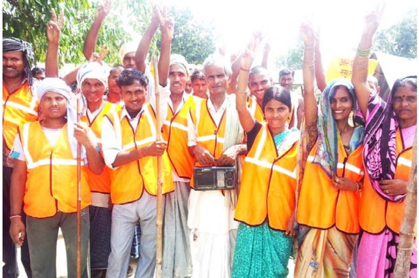
Village level trained task force member.

Flood Forecasting Capacity in the Hindu Kush Himalayan (HKH) Region Understanding the present capabilities of hydro meteorological services in the participating countries and disaster management authorities and utilizing the expertise available is necessary for the development of an Regional Flood Information System (RFIS).