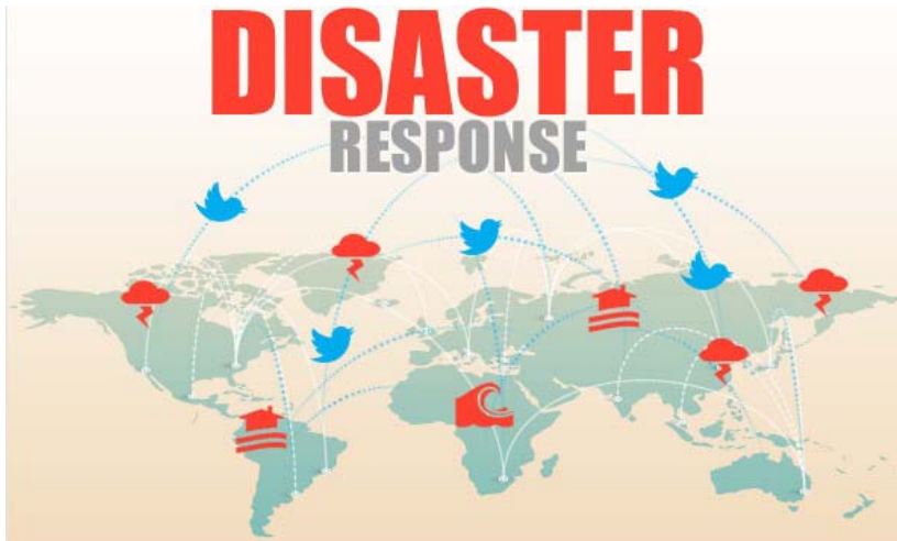
Twitter as a disaster response agent.

Online social media (OSM) has become a popular platform for people to share information on diverse topics. Twitter, a micro-blogging service, has been widely used as an information dissemination agent, particularly during crisis situations such as earthquakes, floods, hurricanes or political conflicts (Wang and Zhuang, 2017). Twitter enables its users to share text and/or multimedia content directly from the location where the incident has taken place, thereby allowing common people to serve as news reporters. Due to this, it has become a common trend to see event updates to be available on social media first and then introduced in the mainstream media thereafter. Continuous efforts are being made to use Twitter as an effective communication channel during crises and for this purpose, Twitter started a new service called Twitter alerts, designed to prioritize information from credible organizations during crises when other communication channels are not accessible.