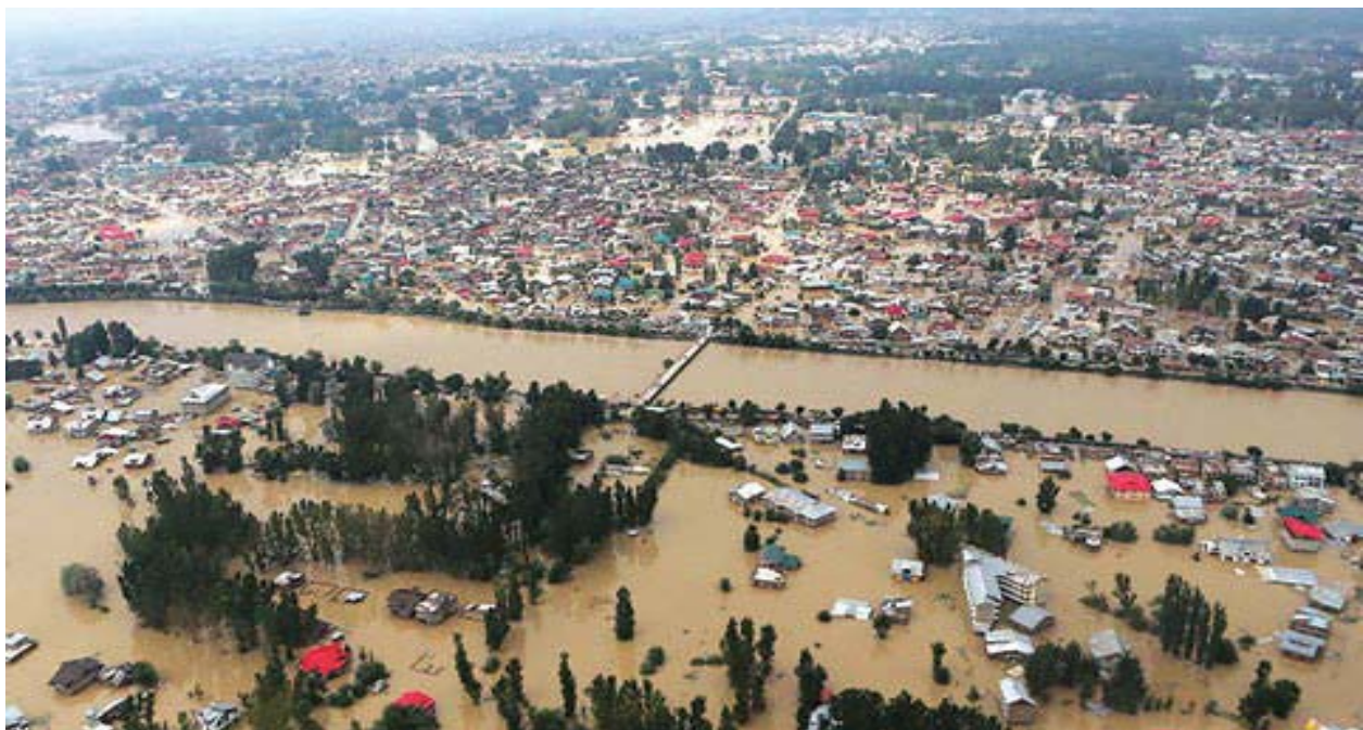
Inundation of Srinagar City - Areal View, 10th September 2014.

The results depict that the State machinery has been created for ensuring a conducive atmosphere of