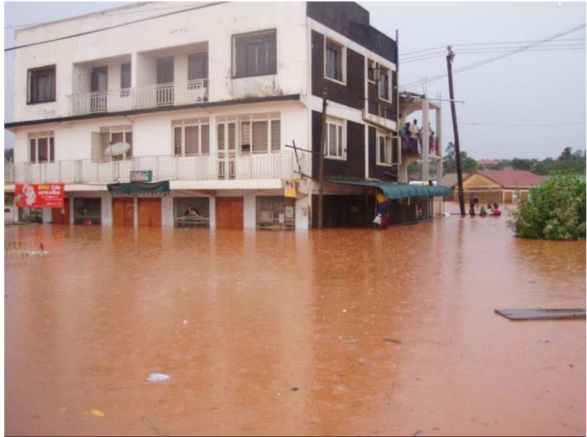
A flooded building in Kampala city suburbs after a heavy downpour in January 2008.

Traditionally, Kampala was a city of seven hills, but over time it has come to have a lot more, due to the increased rate of development, there have been several high rise buildings constructed within the same location. This has largely led to loss of green spaces in Kampala city. Kampala has a tropical rainforest climate under the Köppen-Geiger climate classification system. Another facet of Kampala's weather is that it features two annual wet seasons. There is a long rainy season from August to December and a short rainy season from February to June. However, the shorter rainy season sees substantially heavier rainfall per month, with April typically seeing the heaviest amount of precipitation at an average of